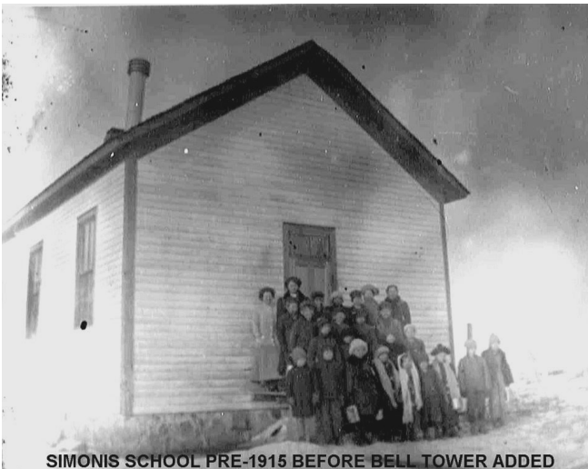
SIMONIS SCHOOL PRE-1915 BEFORE BELL TOWER ADDED

On March 31, 1883, it was decided to form a School District No 3 in the northwestern section of the township (Alban). It became known as the Simonis School , named after the Simonis families that lived in the area. The first Simonis School burned in 1893. Another school was built not far from the first location. This became District No 2. (it was district No 3 when it was first organized in 1883). All the records before 1908 were lost in a fire that destroyed the second school building. A third building was built.