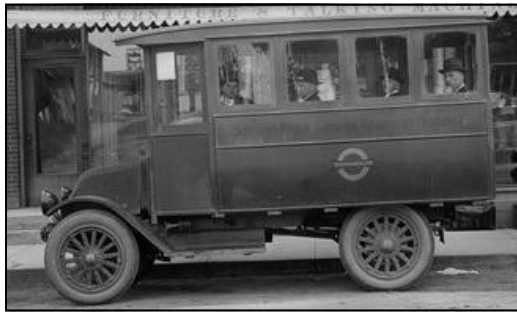
Stevens Point Transfer Co. Bus

Please visit our web site using a desktop computer to download a full list of our publications with ordering instructions. Or, call 715-600-4930 for more information.