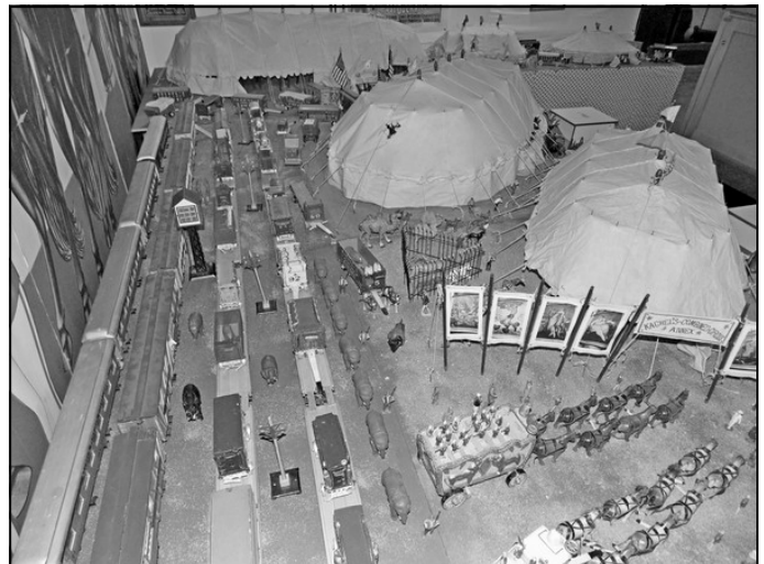
Photo above and at the left shows parts of the Kachel Collection that was on display in the Church Museum in 2014.

The new display will incorporate all of the collection.