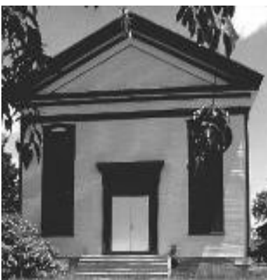
Heritage Park Museum

Located between Madison Ave. and Washington Ave., on the south side of the railroad tracks in Plover, Wi.